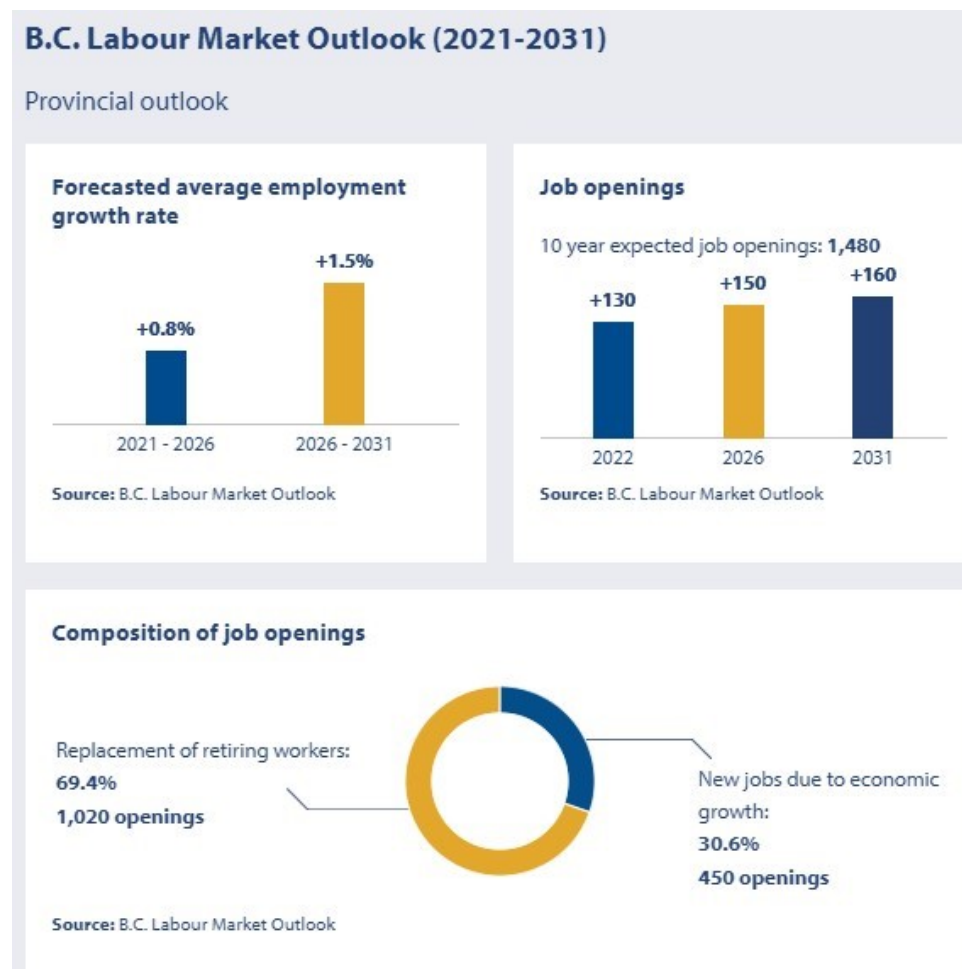
Chart from WorkBC